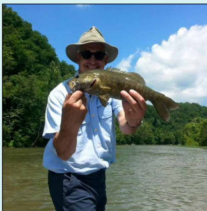
This could be you!