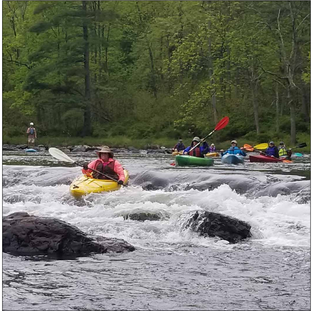
A beautiful day on the Cacapon River

The Cacapon River in West Virginia is a beautiful stretch of water and is an American Heritage River, which means that it gets special attention to further three objectives: natural resource and environmental protection, economic revitalization, and historic and cultural preservation. The river has long been a favorite of Brent Walls, Upper Potomac Riverkeeper.