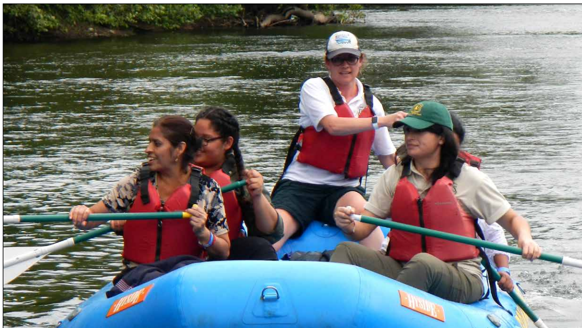
Paddling fun on the River

At last! We are again able to host our popular River-Palooza paddles this year. And RioPalooza this year is going to be bigger and better than ever before!