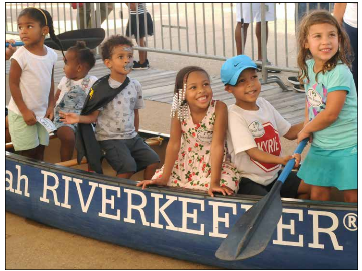
Nothing like seeing the next generation!