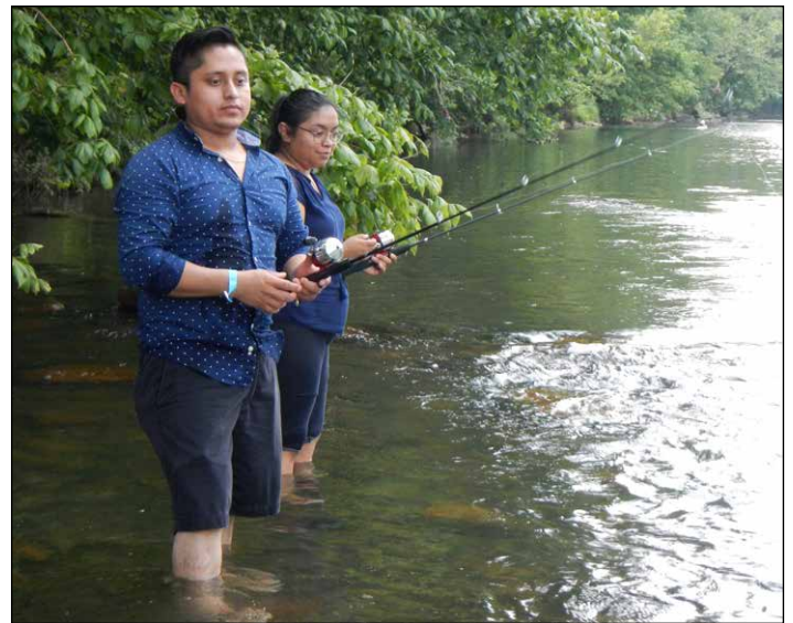
The river sustains all of us