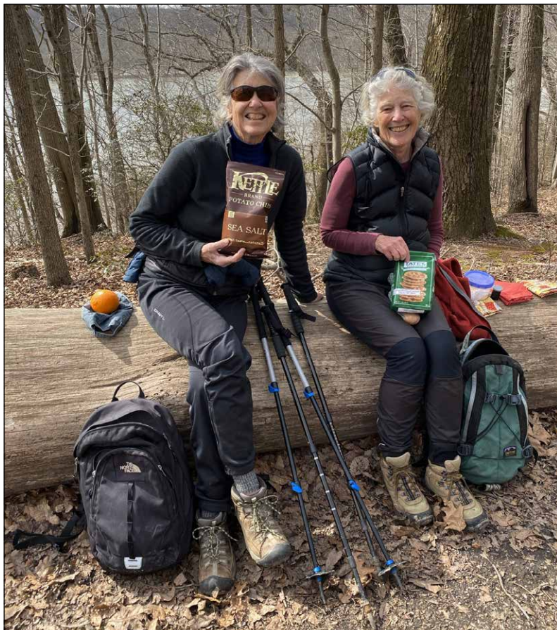
Peer to peer fundraising is fun!