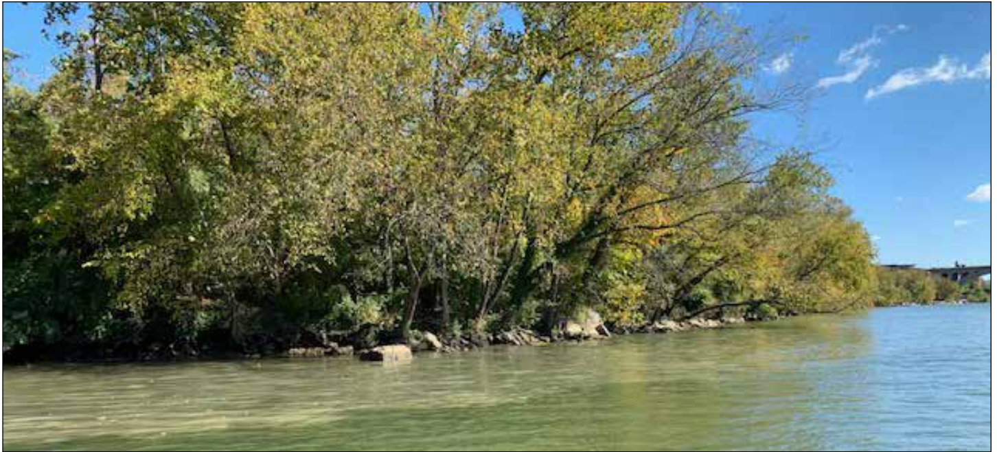
This is why we are acting

Last October, on a beautiful clear day, one of our members – an avid and experienced paddler – was on the river on her prone board – a paddle board on which one is lying down rather than standing – near the Washington Canoe Club in DC, when she became aware of warm cloudy water with an unimaginable stench. She was near Combined Sewer Outfall pipe 29 at the time and knew that it overflows raw sewage when it rains, but she was not expecting to see raw sewage in the water during fair weather. She realized to her disgust that she was paddling in raw sewage!