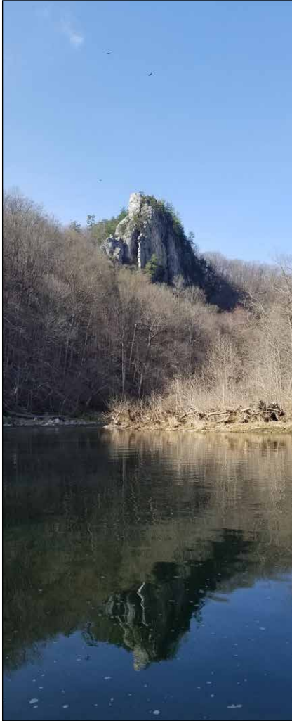
The beautiful Cacapon