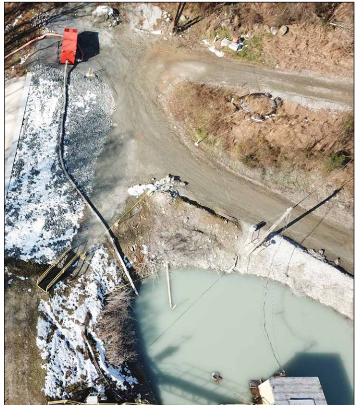
The drone captures this image of SGI's mining operation

Sidley Austin, 150 years after its founding, comprises a diverse group of legal professionals from many cultures who are dedicated to teamwork, collaboration and superior client service. The firm strongly believes in creating opportunities for people of all backgrounds by retaining and promoting outstanding lawyers who reflect the global marketplace and communities that they serve. Its dedication to achieving greater diversity and inclusivity extends beyond the firm to the legal profession as a whole. Sidley Austin is passionate about making a meaningful impact by fostering positive change in many ways. Through its four firmwide pro bono projects, its lawyers and staff devote more than 100,000 hours annually to pro bono work, playing a vital role in people's lives around the world. In addition, Sidley Austin partners with several charitable organizations as part of its corporate responsibility program, enabling its professionals to contribute their talents to a variety of volunteer projects that benefit communities in need.