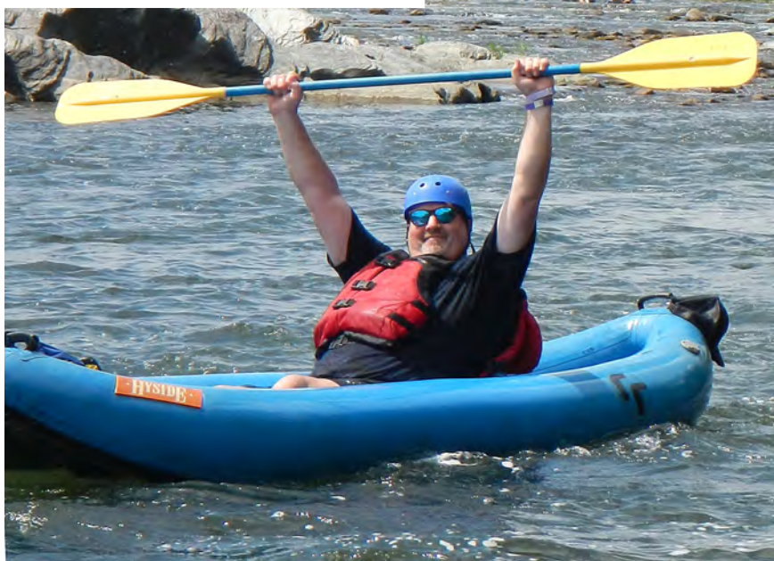
Success on the water!