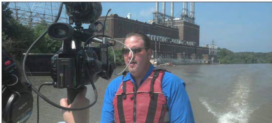
Dean on camera for local media to tell our story far and wide