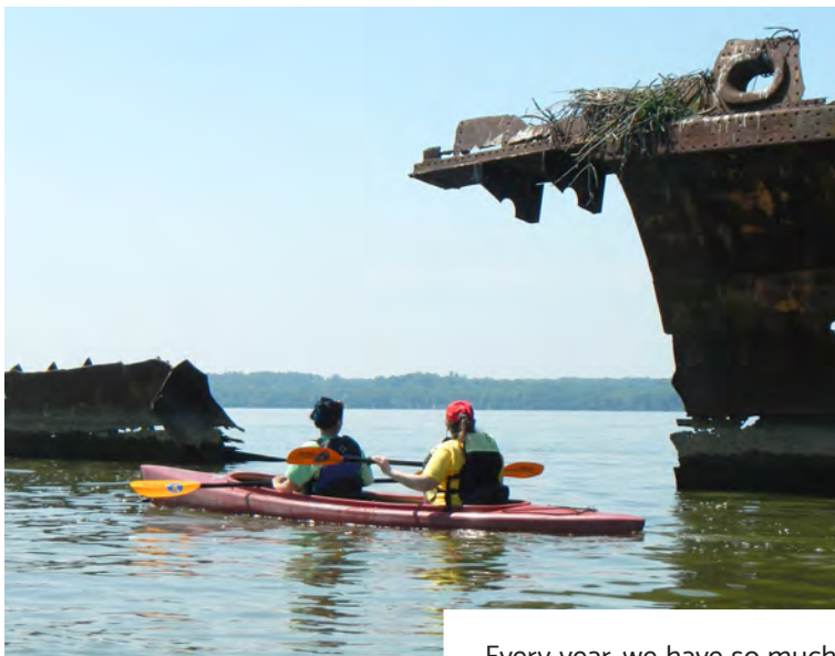
The legendary Ghost Fleet at Mallows Bay