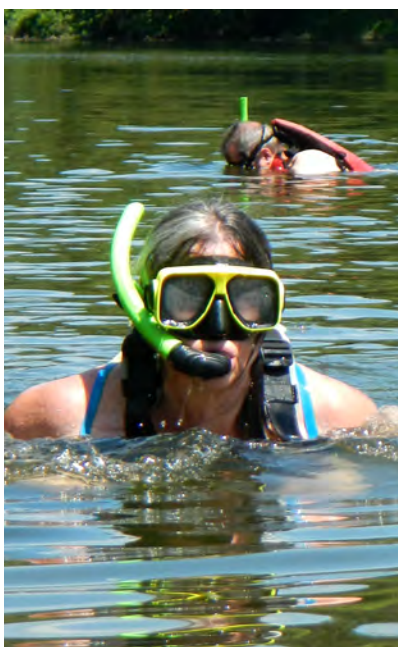
Go snorkeling to see the river from a different perspective!

Every year, we have so much fun bringing the experience of enjoying our waterways to our supporters and friends – both old and new.