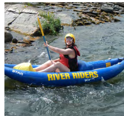
Makes you want to be there!

Next spring, look for the RiverPalooza lineup – and if you haven't enjoyed one of these trips, find out what you have been missing!