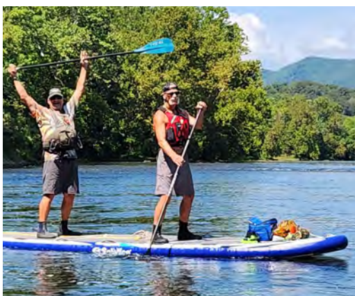
What fun to share the river with a friend!