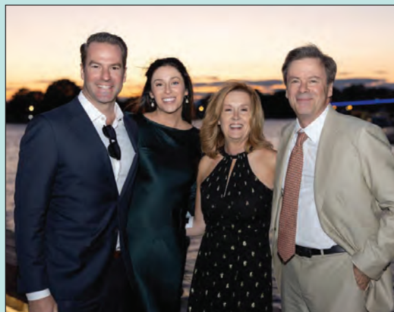
Smiles all around that night!

This year's Gala was a terrific success, thanks to so many! Nearly 290 attended and, for our most important fundraiser of the year, we raised over $300,000!