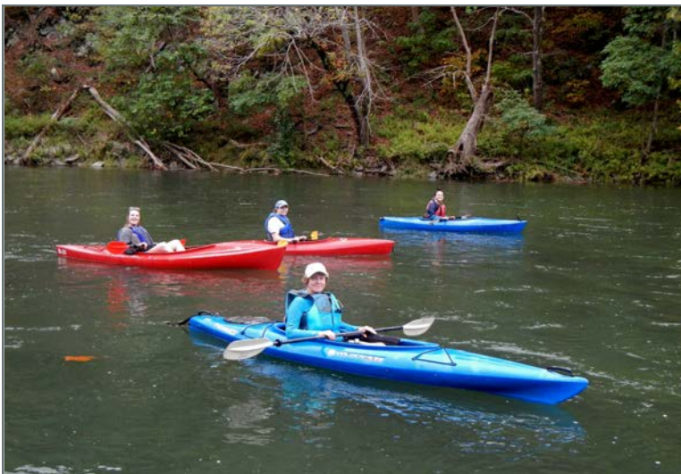
Staff float the Potomac River on the 2019 Staff retreat.

Strive to increase demographic diversity among staff, contractors, interns, and fellows in new hires and contract engagements in order to understand the needs of and communicate as effectively as possible with the many different communities in the watershed