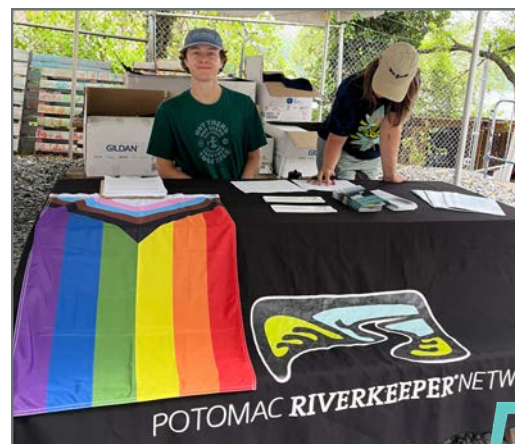
PRKN tabling at DC Pride Event