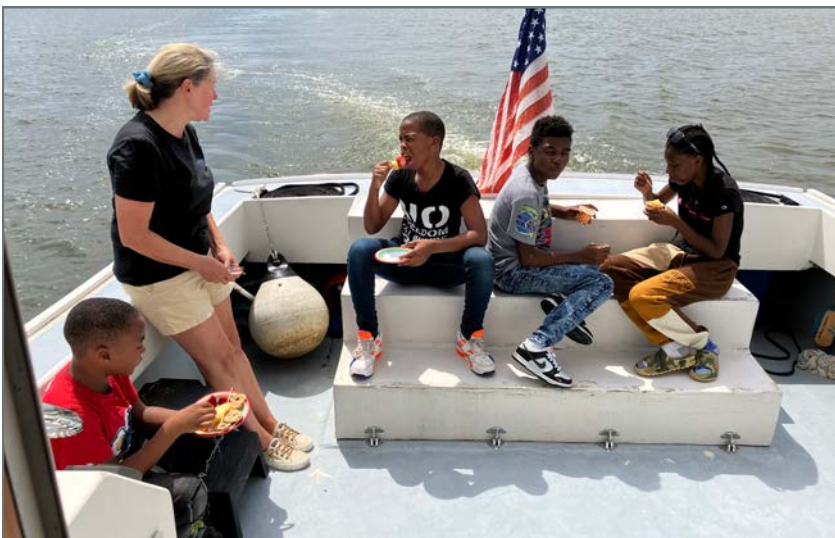
Students from Right Directions DMV learning about PRKN Programs