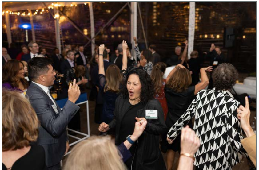
Attendees at the 2022 Gala enjoy the live band