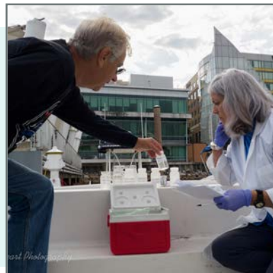
PRKN Water quality monitors.