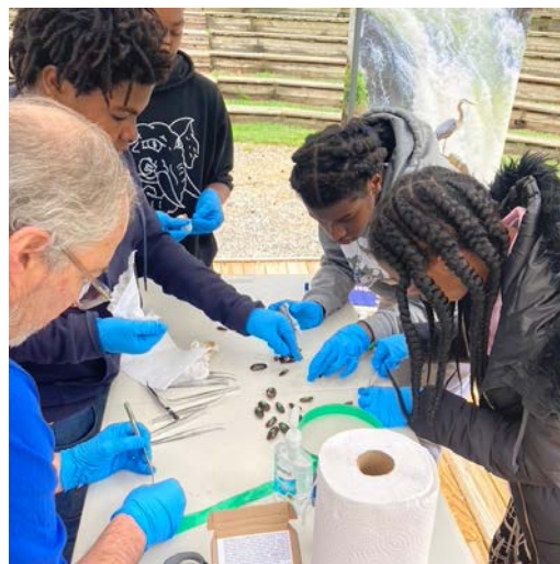
Volunteers tagging mussels.