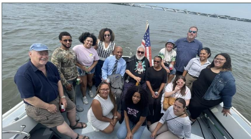
PRKN and Howard University Students aboard the Sea Dog