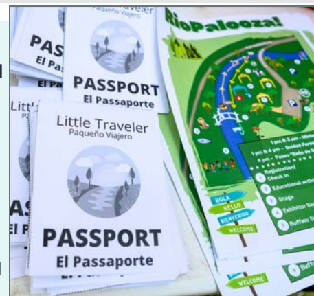
Bi-lingual materials at a PRKN event