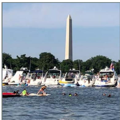
SharkFest Swimmers in the Potomac River