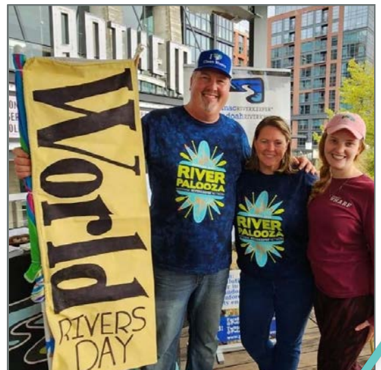
PRKN Staff at World Rivers Day