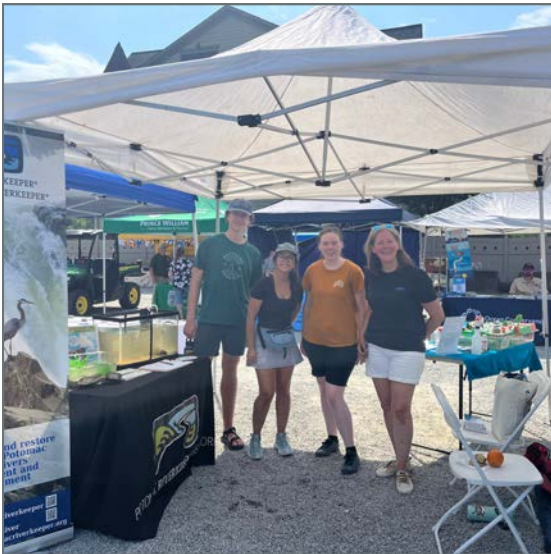
Staff & Volunteers at Occoquan RiverFest