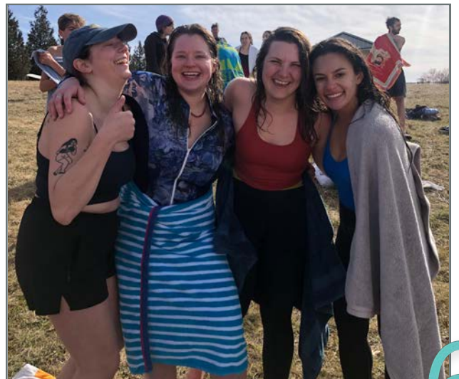
Staff braving the cold during the 2023 Polar Plunge.