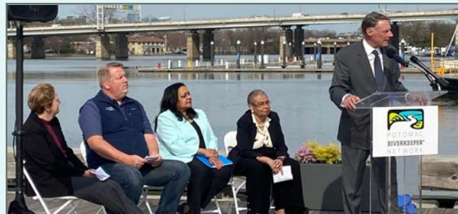
Staff and Board members speak at World Water Day